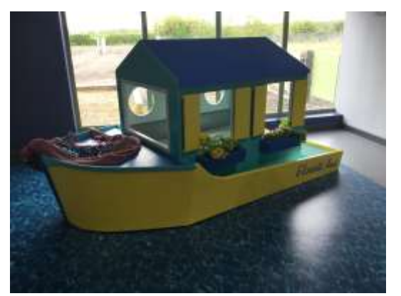
We went to visit Play Avenue in Messingham

This is what it looks like inside the Nursery. We have lots of areas to play such as our role play area, our cosy book corner and our construction area.